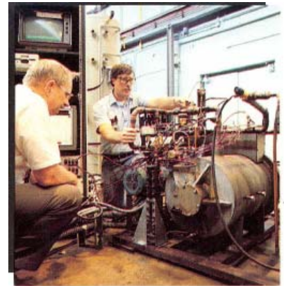
MOTOR PLUG-REVERSAL TESTER Thousands of cycles can quickly evaluate insulation materials and winding methods

1973 - 1998 Member, Purdue International Compressor Engineering Conference Advisory Council