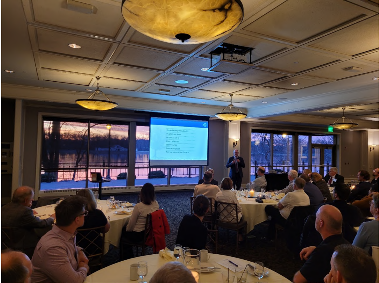
Figure 6: La Crosse ASHRAE 50 th Anniversary Celebration on April 13 th , 2022 (Mick Schwedler, ASHRAE President)