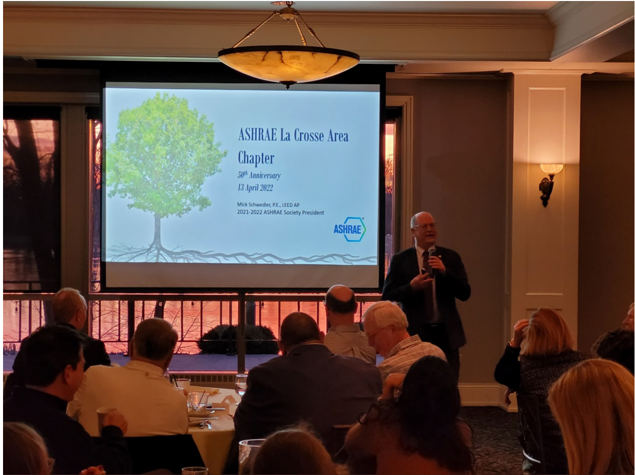
Figure 5: La Crosse ASHRAE 50 th Anniversary Celebration on April 13 th , 2022 (Mick Schwedler, ASHRAE President)