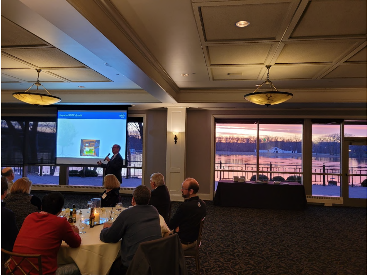
Figure 7: La Crosse ASHRAE 50 th Anniversary Celebration on April 13 th , 2022 (Mick Schwedler, ASHRAE President)